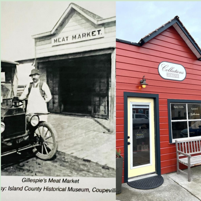
Gillespie's Meat Market