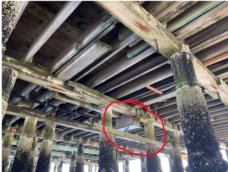
Septic Tank from under the wharf