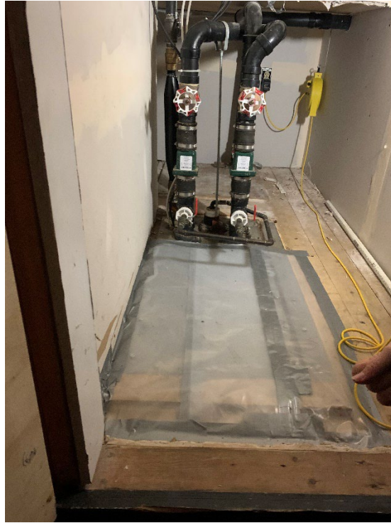
Current Septic Tank inside