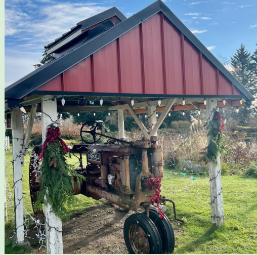
Farm Lights Daily at Greenbank Farm

For updates on all three Holiday Market weekends including food + beverage, live music, and Santa Claus hours, visit our Facebook page: