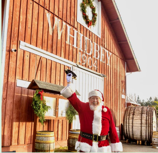
Santa Arrives By Firetruck Sat, Dec 6 at 3:00