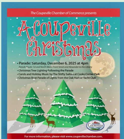
Greening Of Coupeville Parade & Tree Lighting Sat, Dec 6 – 4:00