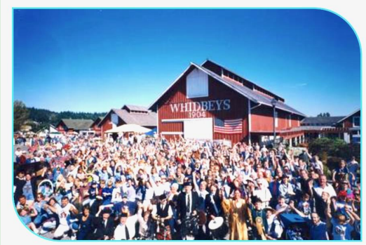
Port of Coupeville purchased Greenbank Farm in 1997

The Port of Coupeville purchased the Coupeville Wharf in 1969. Three decades later, the Port of Coupeville purchased Greenbank Farm in 1997.