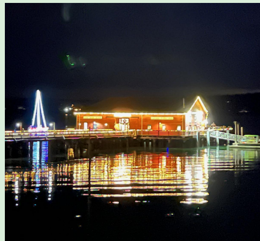
Holiday Boat Parade Coupeville Wharf Sat, Dec 6 – 5:30 (Weather Permitting)