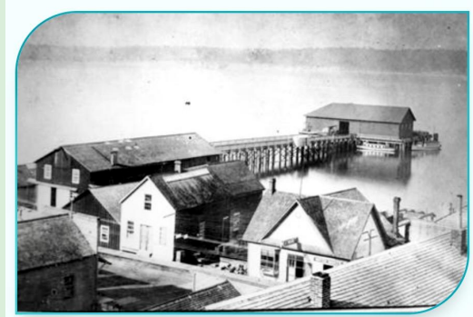
Port of Coupeville purchased the Coupeville Wharf in 1969